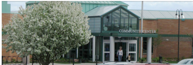
Main Entrance, Maple Grove Community Center

Meetings are held at the Maple Grove Community Center , at 12951 Weaver Lake Road, Maple Grove, right off I-94.